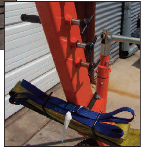
Strap Attachment Bolts Lifting & Main Load Straps