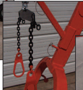
Spreader Bar & Hooks