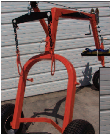
Pole Mount Set-up