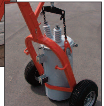
Pole Mount Ready To Go